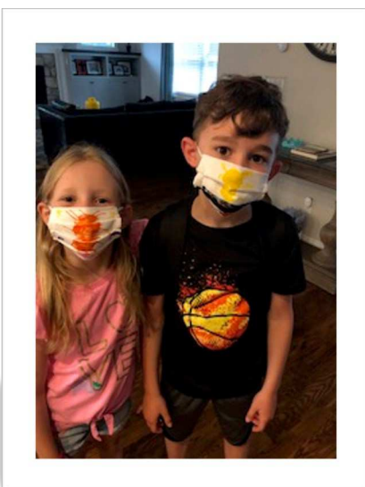
This brother and sister decorated their face masks at Virtual Vacation Bible Camp