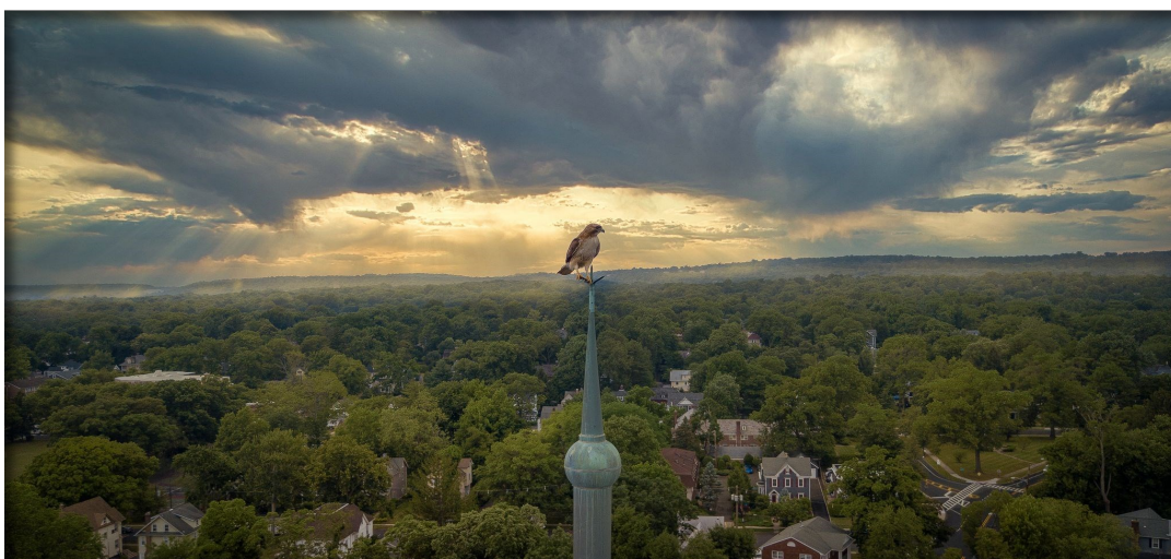
Bird's eye view from the top of the PCW spire— taken by drone.